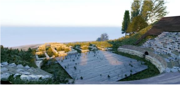
Figure 3 – Rendering of the 3D model representing the existing conditions of the theatre.