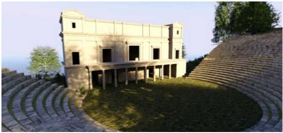
Figure 4 – Rendering of the 3D model representing the Hellenistic shape of the theatre.

Figures 3 and 4 show the rotation of the immersive experience taken at the same position in the cavea, related to the existing conditions of the theatre.